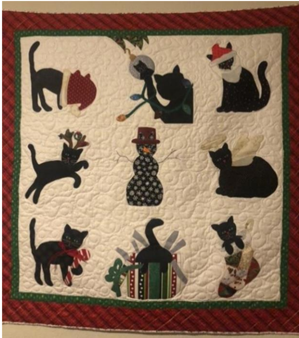
Stash Only Christmas Quilt by Helaine Campbell