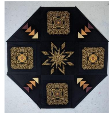
Black and Gold Panel Table Topper by Trina Jahnsen